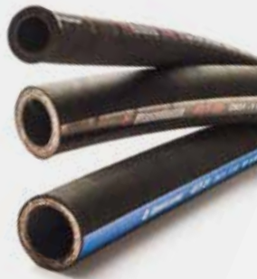
Bridgestone Hose Range