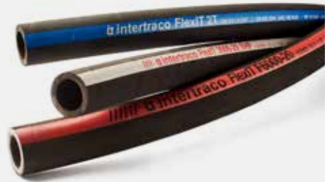
Intertraco Hose Range