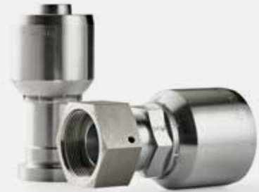
One Piece Fittings