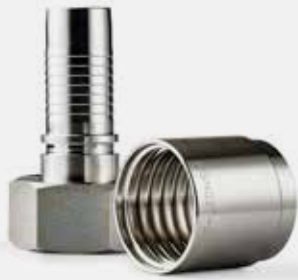
Two Piece Fittings